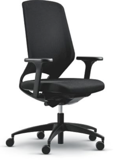
D-1075-DGLF (2D- Armrest) / D-1075-DGLM (5D- Armrest)